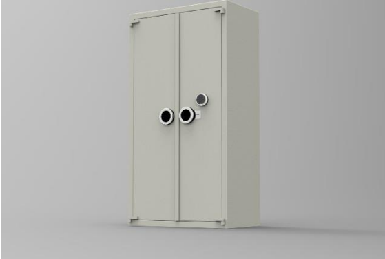
Armario ASI 190 K / E